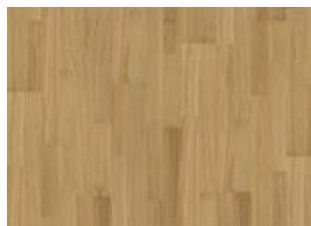
Pure Oak 2-strip