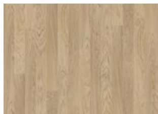
Whole Grain Narrow