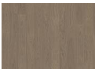
Earl Grey Wide