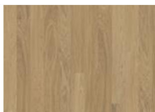
Light Suede Wide