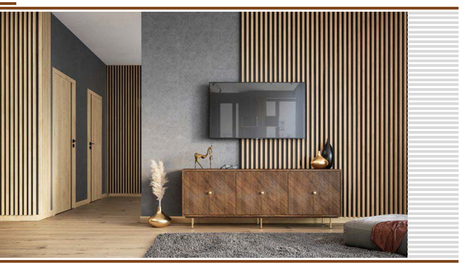
Decorative panel: decorative strip OAK STC PL, adapter BLACK ST CPL, skirting board OAK ST CPL, door BALDUR 3 OAK ST CPL, black VSG glass

Decorative panels are mounted on the wall as a decorative element and at the same time improve the acoustics in the room.