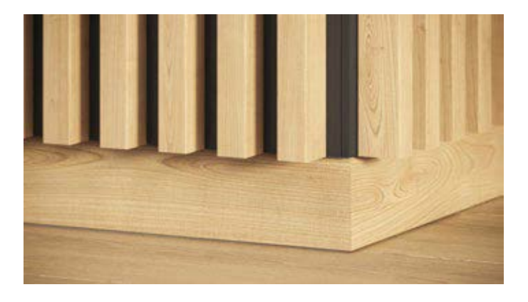
composition of decorative panels with the skirting board OAK ST CPL

Decorative panels are available in the PREMIUM and ST CPL laminates, which can be put together in combinations of your choice.