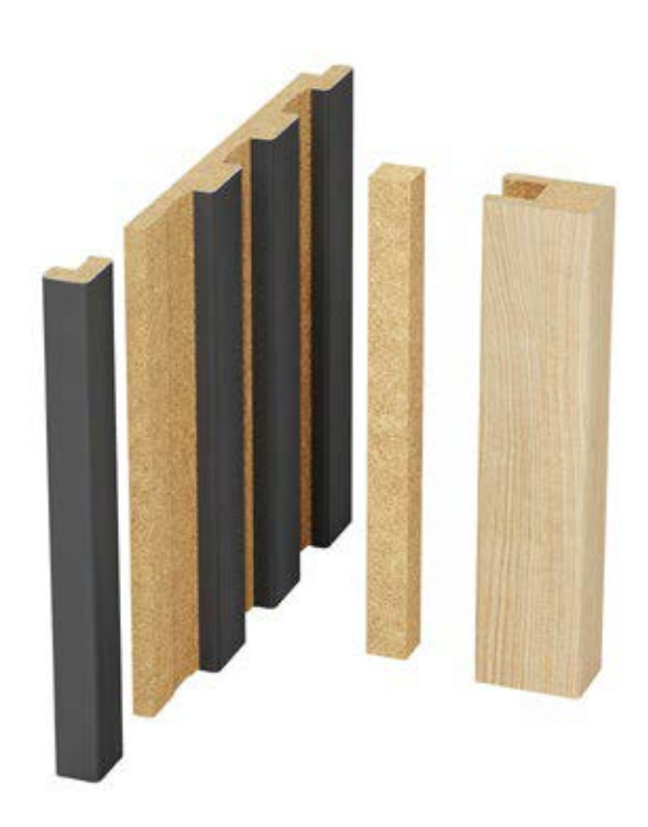
components of the decorative panel