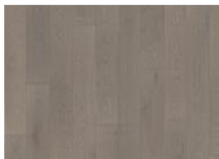
Oak Nouveau Taupe