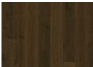
Oak Nouveau Tawny