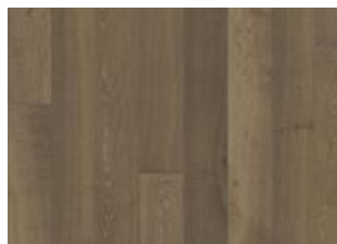
Oak Nouveau Greige