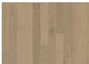
Oak Nouveau White