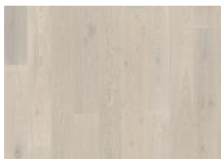
Oak Nouveau Snow