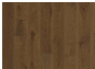
Oak Nouveau Rich