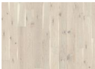
Oak Nouveau Lace