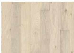
Oak Nouveau Blonde