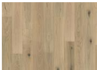
Oak Nouveau Whisper