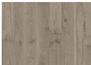
Oak Nouveau Gray