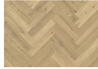
Herringbone Oak CC Dim White