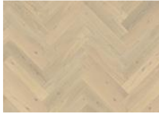
Herringbone Oak CD White