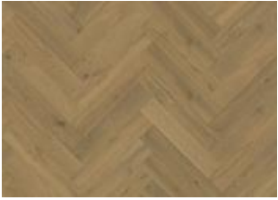
Herringbone Oak CD Grey