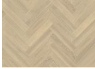
Herringbone Oak AB White