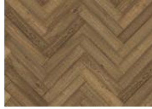
Herringbone Oak CD Smoked