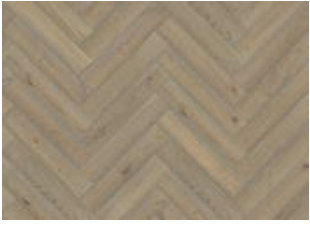
Herringbone Oak CC Vintage White