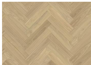
Herringbone Oak AB Dim White