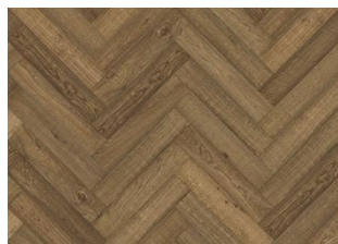
Herringbone Oak CD Smoked