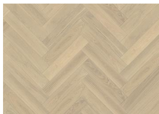
Herringbone Oak AB White